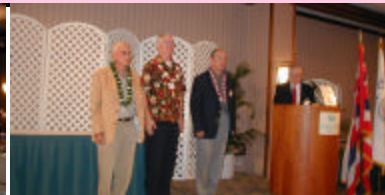
Swearing In 2002 Officers