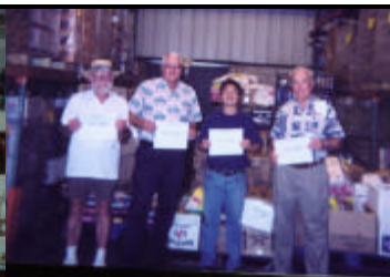
Hawaii Food Bank