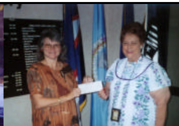
VA Nursing Home