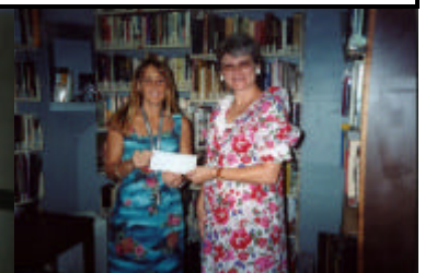
U.S Army Museum