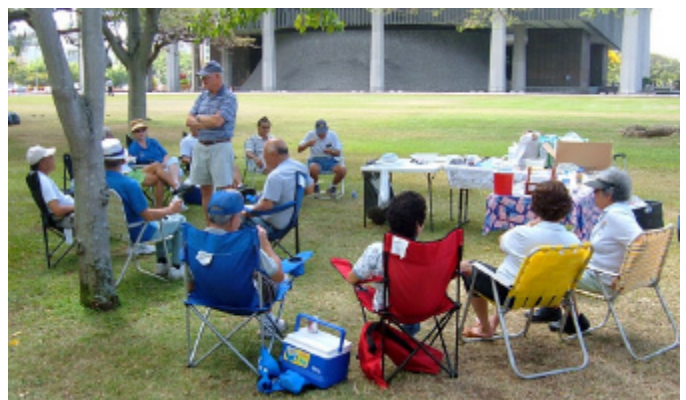
After Cleaning the Korean/Vietnam War Memorial, our Aloha Chapter Volunteers Relax and Enjoy Snacks and Refreshments on the State Capitol Grounds