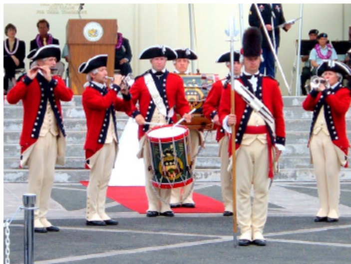
The Old Guard Fife and Drum Corps providing stirring, synchronized music at the State Veterans' Cemetery