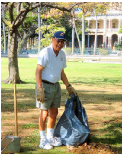
Vernon Von Picking up Leaves

Our weekly groups of volunteers finished these easy tasks in about 1½ hours and then gathered for snacks, refreshments and fellowship. Not only was a good time had by all, but everyone had a real heartwarming feeling of accomplishment and