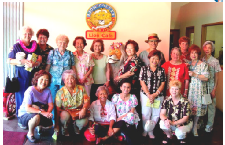
Merrie Ladies and a lion after their tour of Lion Coffee

served and 25 men and women will be gathering at the Honolulu Academy of Arts on August 8th for the tour. A wait list is being taken in case there are openings later.